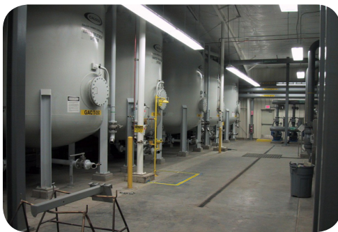
Indoor Treatment Facility