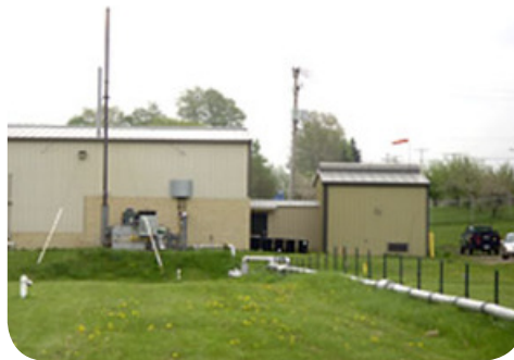
Groundwater Treatment Building