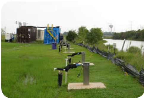
Groundwater Pumping Wells

Pump and treat is used to remove a wide range of contaminants that are dissolved in groundwater. Pump and treat typically is used once the source of groundwater contamination, such as leaking drums and contaminated soil, has been treated or removed from the site. It also is used to contain plumes so that they do not move offsite or toward lakes, streams, and water supplies. Pump and treat is the most common cleanup method for groundwater. It has been selected or is being used at over 800 Superfund sites across the country.