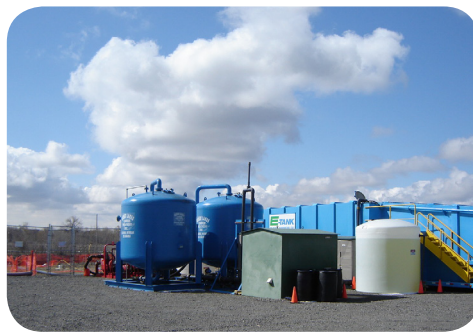
Outdoor Treatment Facility