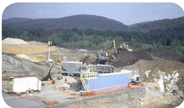
Contaminated soil mixed with cement in a pug mill is spread on the ground as pavement.

Solidification and stabilization provide a relatively quick and lower-cost way to prevent exposure to contaminants, particularly metals and radioactive contaminants. Solidification and stabilization have been selected or are being used in cleanups at over 250 Superfund sites across the country.