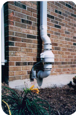
Typical fan and vent pipe.

Mitigation systems have been installed and operated at hundreds of homes near Superfund sites and other contaminated sites across the country.