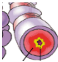
Figure #2: Bronchial tube inflamed and showing signs of excess mucus during an asthma attack