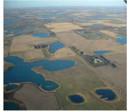
The Prairie Pothole region in North and South Dakota.

Additionally, the recent pine beetle outbreak in the Rocky Mountains has altered the hydrological functioning of these ecosystems by influencing snow distribution and snowmelt in complex ways. Other considerations that affect the timing of snowmelt include dust events and rain on snow.