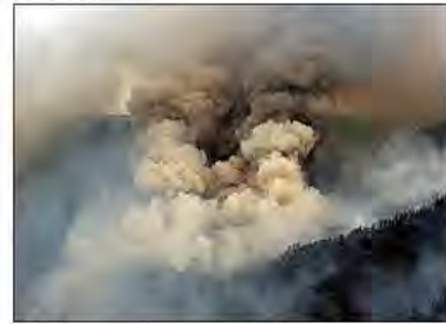
Smoke plume from the Hayman fire.

Since the fire, precipitation events have resulted in massive soil erosion and dumped enormous quantities of sediment into Denver Water’s reservoirs and intake systems. The domestic water supplier to the City of Denver has expended tens of millions of dollars in water quality treatment, sediment and debris removal, slope reseeding, and infrastructure projects as a result of the fire.