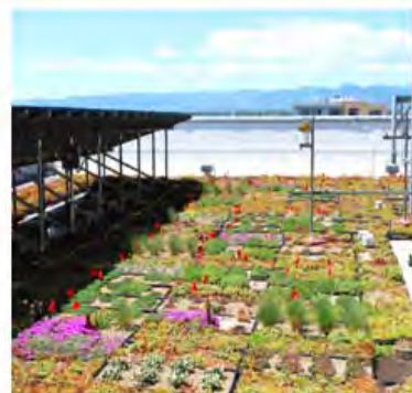
The EPA Region 8 Headquarters' green roof with study plots and instrumentation. The solar panels provide beneficial shade during hot weather.

Slabe, T. and O'Connor, T. 2011. DRAFT - Thermal Characteristics of an extensive green roof and a gravel ballasted roof in high elevation, semi-arid, temperate Denver, Colorado, U.S.A. EPA/R-600/XXX-08. December, 2011.