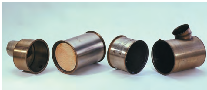
Brand New Disassembled Diesel Particulate Filter (DPF)

More information and hazardous waste compliance assistance is available at: www.ccar-greenlink.org/vshops/vshop1/hazardous.html