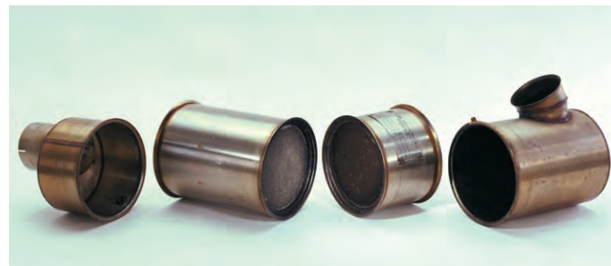
Disassembled Diesel Particulate Filter (DPF) After Several Thousand Hours of Use