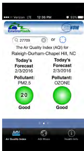
Figure 6. The AirNow widget