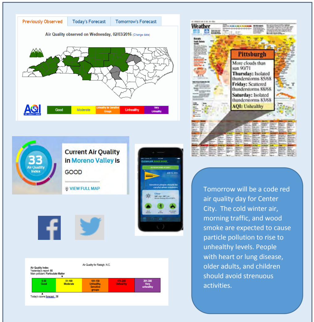
Figure 1. The AQI is reported in many formats.

The purpose of the AQI is to inform people about their air quality so they can take steps to protect their health. This is especially important whenever the AQI exceeds 100. To reach the most people, try to deliver the AQI in as many ways as possible.