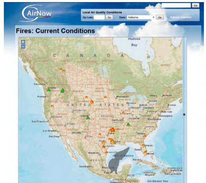
Figure 5. The AQI on AirNow's Fires: Current Conditions page