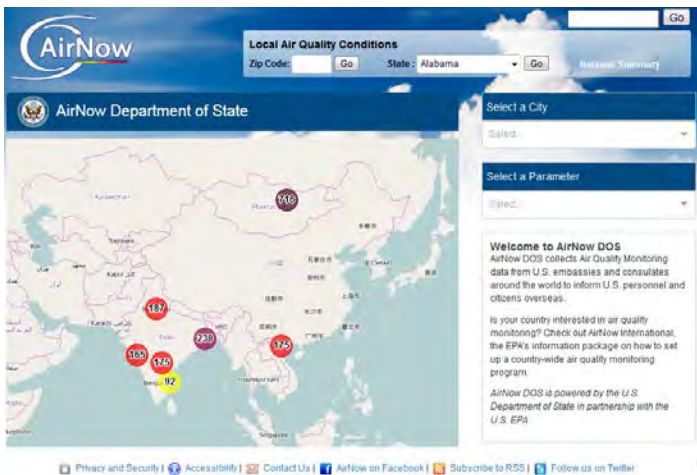
Figure 4. Airnow.gov page showing the AQI at U.S. Embassies and Consulates