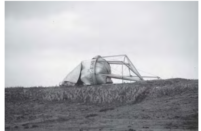
A water tower that has exceeded its useful life!

The worksheets and other information in this guide will also help you begin to develop an overall strategy for your system. Using this guide along with EPA's "Strategic Planning: A Handbook for Small Water Systems" (EPA 816-R-03-015) will help you develop, implement, and receive optimal benefit from an asset management plan that fits in with your system's overall strategy.