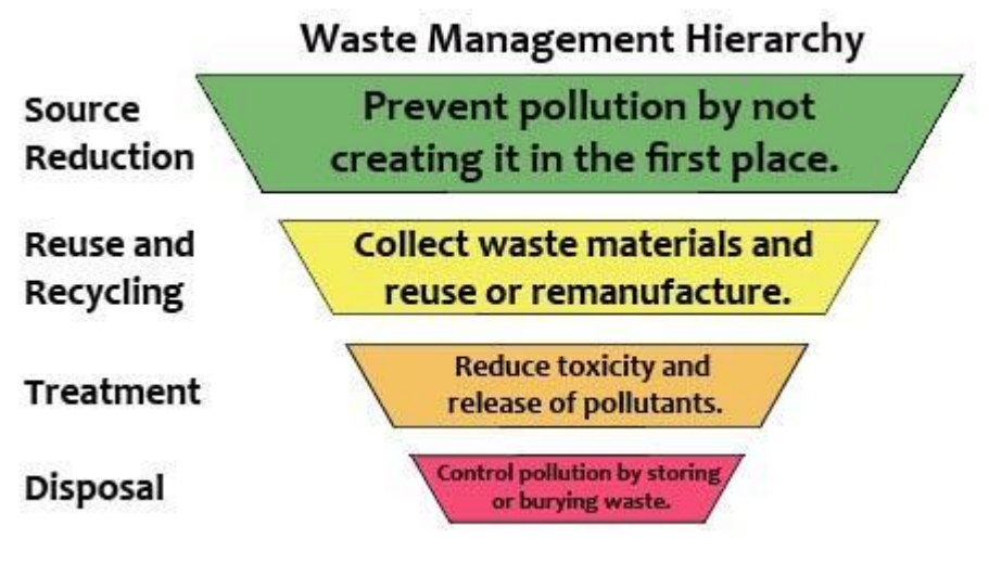
Figure 1: The EPA's Waste Management Hierarchy

Pollution prevention is any practice that reduces, eliminates or prevents pollution at its source, also known as "source reduction." Source reduction is fundamentally different and more desirable than recycling, treatment and disposal. According to the Pollution Prevention Act of 1990 (PPA),<sup>1</sup> the United States annually produces millions of tons of pollution and spends tens of billions of dollars per year controlling this pollution. Reducing the amount of pollution produced should mean a decrease in the control, treatment and disposal of waste as depicted in the EPA's Waste Management Hierarchy in Figure 1.