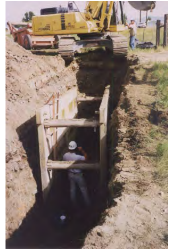
Preparations for Pipe Installation in a Distribution System