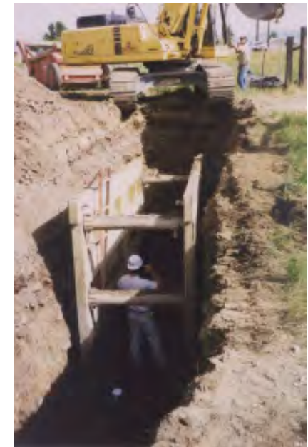
Preparations for Pipe Installation in a Distribution System