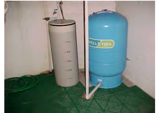
A Hydropneumatic Storage Tank