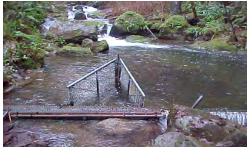
A Drinking Water Intake for a Surface Water System