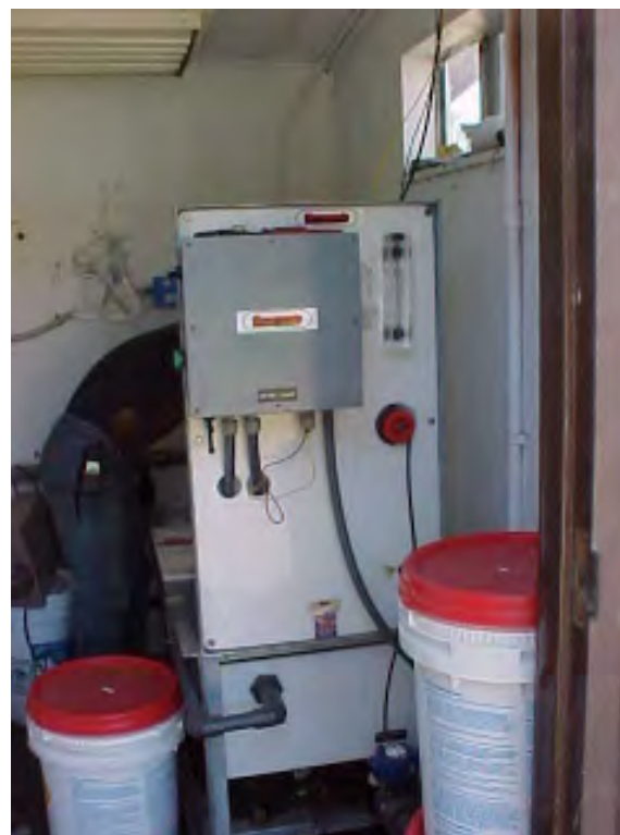
A Chlorination System

Remember that the typical useful life of disinfection systems is 10 years. In this example, adjusted useful life for the chlorinator is 5 years lower than the typical useful life because the system has not properly maintained it.