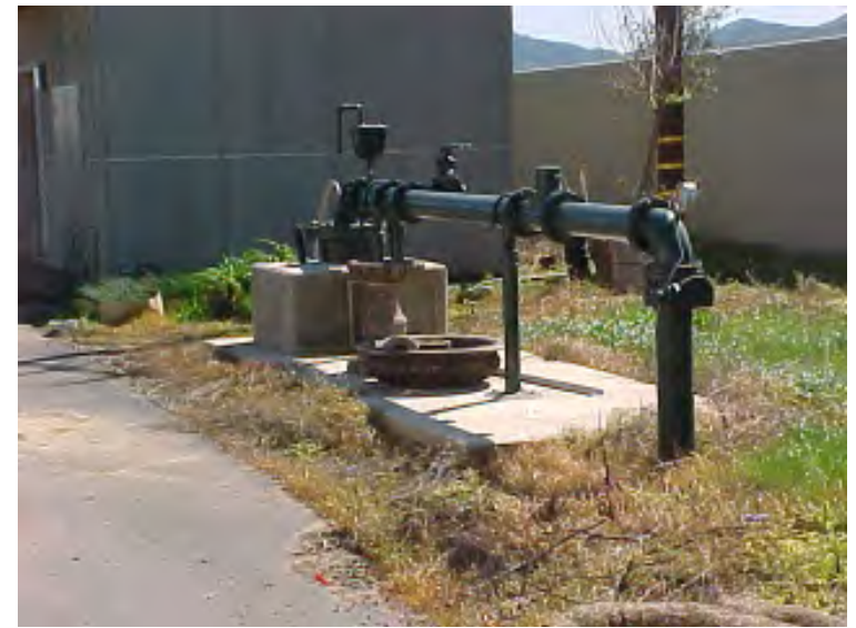
A Ground Water System Well