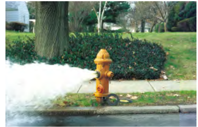
Hydrants Provide Water for Fire Suppression, Line Flushing, and Irrigation.