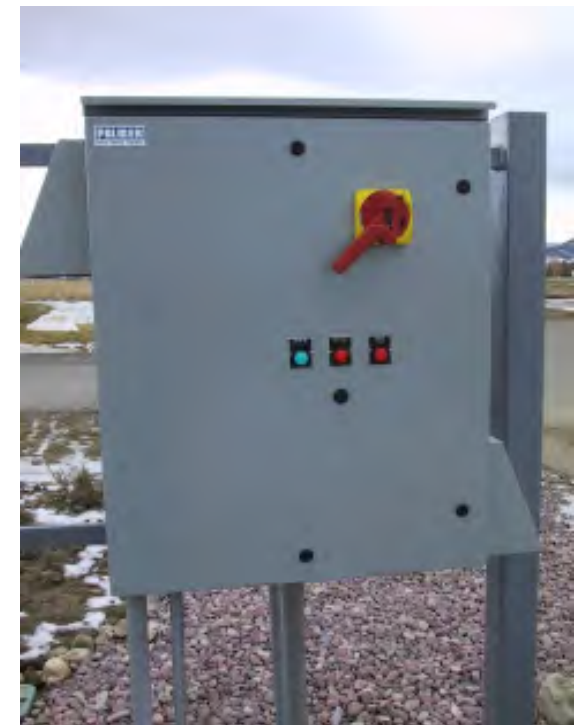
A Variable Frequency Drive

Remember that the typical useful life varies by type of electrical equipment. The typical useful life for computers is 5 years, sensors typically last 7 years, MCCs, and VFDs typically last 10 years, and transformers, switchgears, and wiring typically last 20 years. In this example, the adjusted useful life is the same as the typical useful life because the computer has been properly maintained.