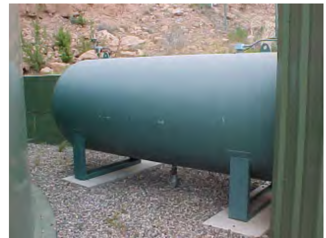
A Metal Storage Tank