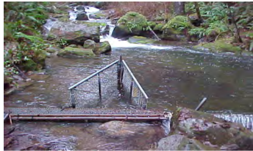
A Drinking Water Intake for a Surface Water System