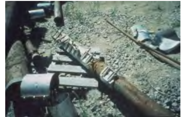
Service Lines Deliver Water to the Customer's Plumbing Connection

Remember that the typical useful life for service lines is 30 years.