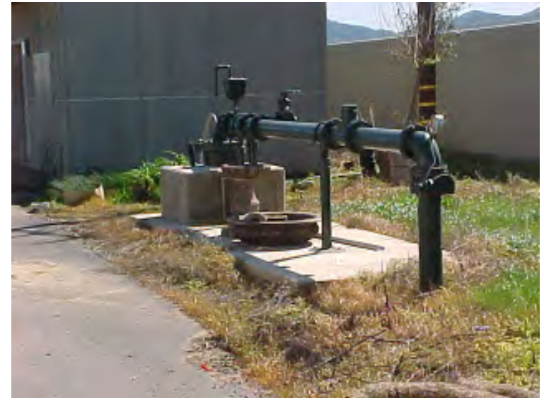
A Ground Water System Well