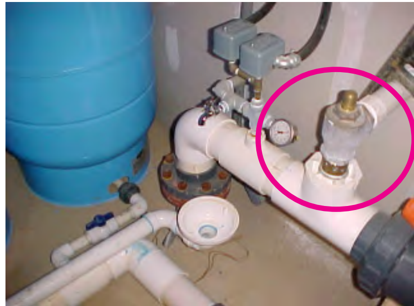
An Air-Pressure Relief Valve

Remember that the typical useful life of valves is 35 years.