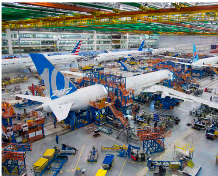
The Boeing Company 787 assembly facility in Charleston, SC.

Boeing received the necessary permits to expand onto 468 acres, including a major air permit and a wetlands permit, just over six months after the permit applications were filed. One component of the company's comprehensive wetlands mitigation plan involved protecting wetland and upland resources