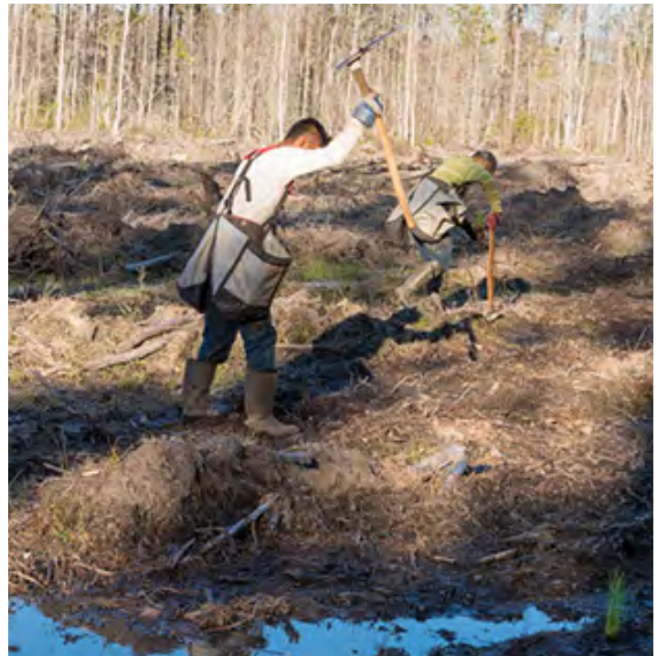
Planting longleaf pines as part of the mitigation plan.

The Open Space Institute has worked on three projects immediately adjacent to the site for other mitigating parties since the completion of this project – and they all had similar approaches.