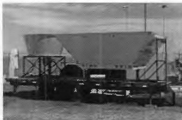
Figure 1. Remote sensors mounted on flatbed trailer. From left to right: Ceilometer, sodar, and radar.

The radar, sodar, and ceilometer are mounted on a 7-m flatbed trailer. The radar sits on the front end of the trailer while the sodar is situated in the rear. The ceilometer resides near the back edge of the trailer (Figure 1). Leveling of the trailer (and hence the sensors) is accomplished with the use of seven jacks mounted along the sides and front of the trailer.