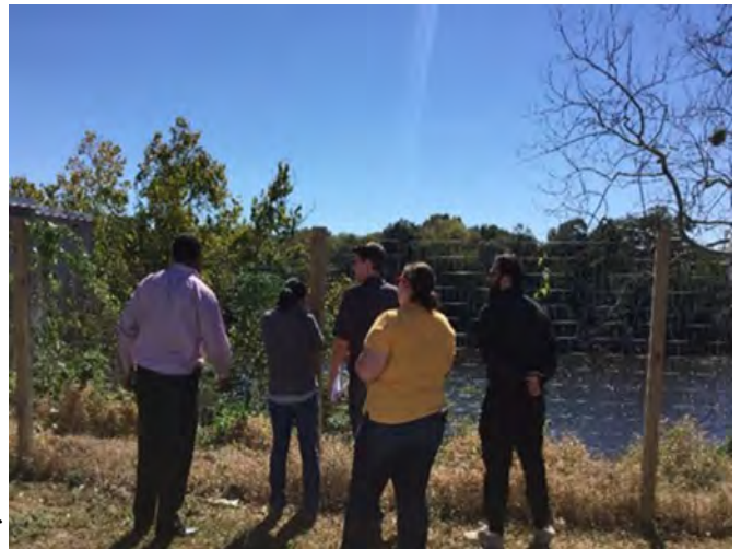
Students from Georgia Tech looking at the geology of the Alabama River

The study looked at options to address erosion of the Alabama River along the shore line of the city of Selma, Alabama, and the potential impact along the Historic Edmund Pettus Bridge. The study was valued at approximately $120,000 and contributed to Selma's 20% cost-share responsibility to the Alabama River preservation project that is being implemented in partnership with USACE. Preserving the shoreline and ensuring the safety of the bridge maintains the historical significance of the bridge and contributes to the economic impact on over 18,000 local citizens, and over 20,000 annual tourists to the city.