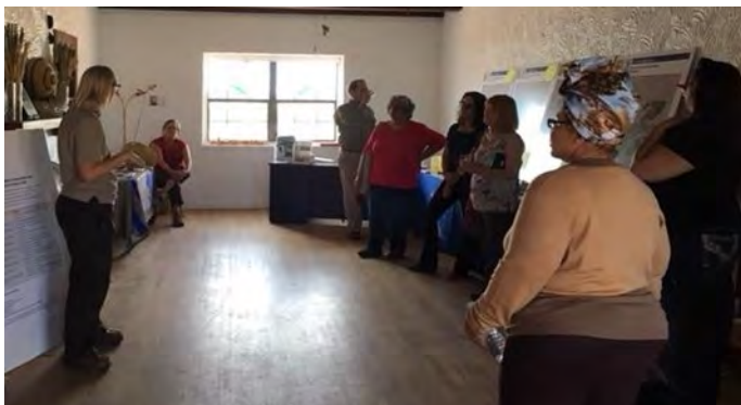
Visit to Valle de Oro by members of EJ IWG and Southwest Indian Polytechnic Institute (SIPI)

Project: Develop the first Environmental & Economic Justice Strategic Plan for Valle de Oro National Wildlife Refuge (The completed plan is available at www.FriendsOfValleDeOro.org .)