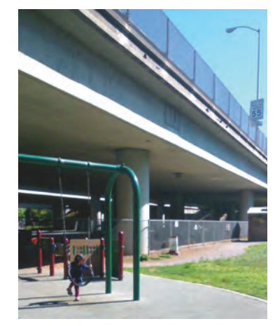
Proximity to traffic is one of the 11 environmental indicators.

EJSCREEN is an environmental justice screening and mapping tool that utilizes standard and nationally-consistent data to highlight places that may have higher environmental burdens and vulnerable populations. The tool provides both summary